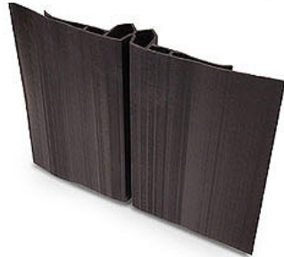
BG-0200-P shown in positive side wall orientation.