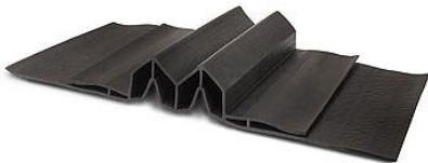
BG-0400-P shown in underslab orientation