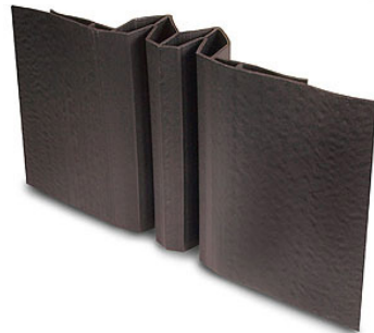
BG-0400-P shown in positive side wall orientation.