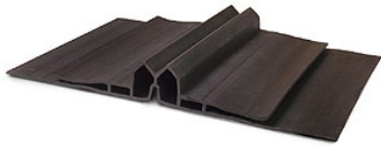
BG-0200-P shown in underslab orientation